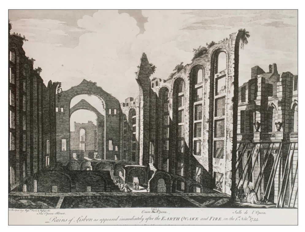
Fig. 1. Ruins of Lisbon Opera House. Le Bas engraving (1757). City Museum of Lisbon, J. Kosák Coll.: Historical Earthquakes.

dust and ash. Reports of that time show slight differences regarding the time, intensity, and orientation of telluric movements (Braga 2007, 42). According to some observers, the earth swallowed things and people vertically, and this impetus produced a rocking motion very similar to that of a vessel as it sinks (Carvalho 1987, 182).