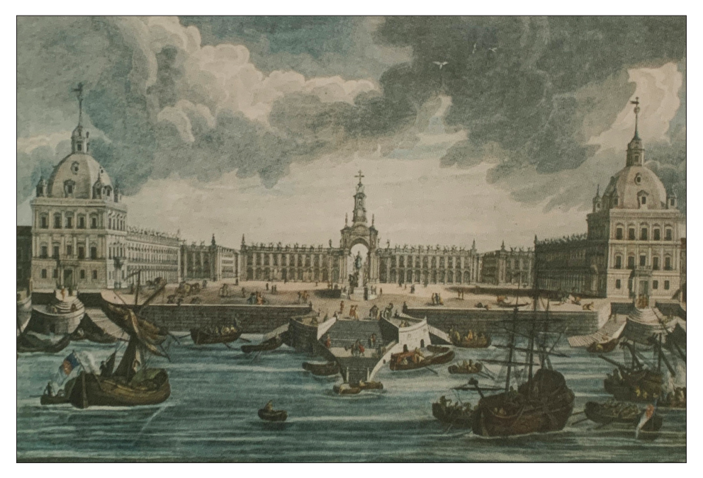
Fig. 4. Carlos Mardel's project for the reconstruction of Royal Commerce Square. Coper engraving, eighteenth century.

stallations were projected (Senate, Stock Market, Arsenal and Royal Courts) and rental buildings were distributed along the adjacent streets, which was one of the distinctive marks of the new social landscape of the Baixa (downtown), with a bourgeois accent. Formally, the reconstruction work began after the publication of the law of 12 May 1758, which guaranteed new rights to the owners, imposed a five-year term for the building on each plot – which was not respected – and provided for special situations of transfer and mortgage of the property.